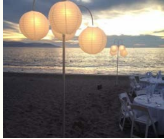
$75 USD each