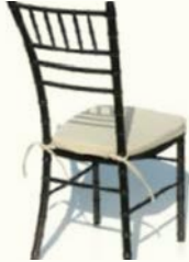
Chocolate Chiavari Chair $9 USD each