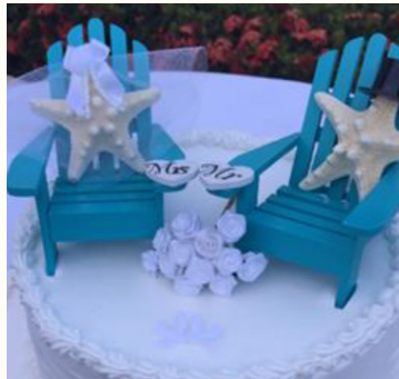
Cake topper $20 USD