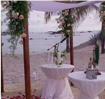
Canopy 4 $580 USD