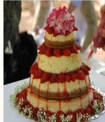
Cheese cake $2 USD extra for each guest