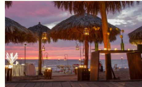
Subject to quote