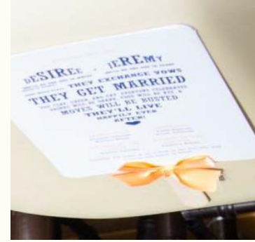
Fans From $5 USD each