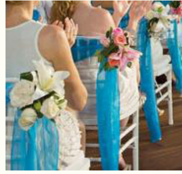
Flowers for chair From $35 USD each