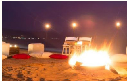
Subject to quote