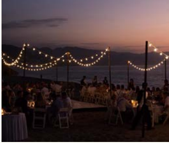
Hanging Bulbs $120 USD each string