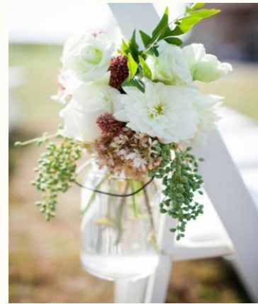
Flowers for chair From $20 USD each