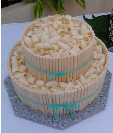
White chocolate decoration $70 USD