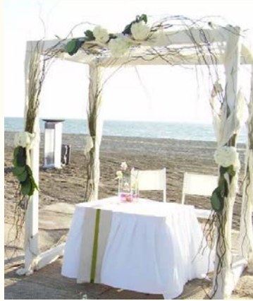
Canopy 2 $650 USD