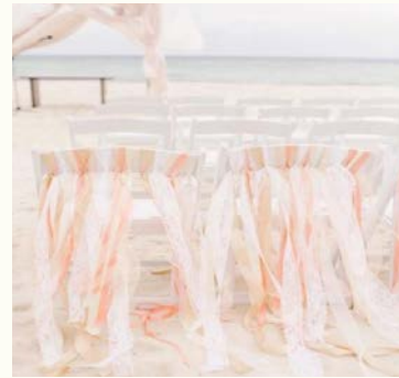
Bows for chairs From $7 USD each