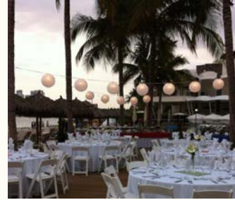
$90 USD each