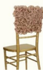
Short Moroccan Style Chair Cover $7 USD each