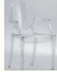
Ghost Chair $18 USD each