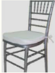
Silver or Gold Chiavari Chair $9 USD each