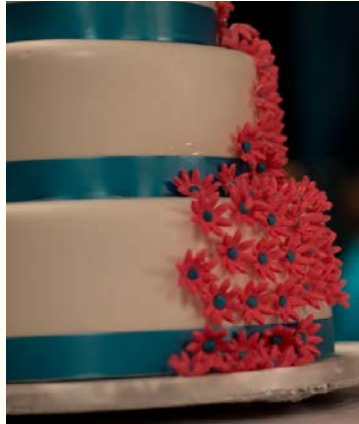
Fondant cake with ribbon $7 USD extra for each guest