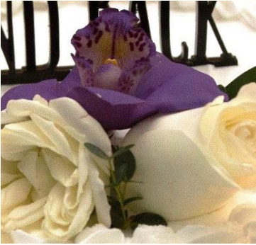
Cake flowers From $25 USD