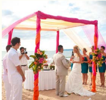
Canopy 5 $610 USD