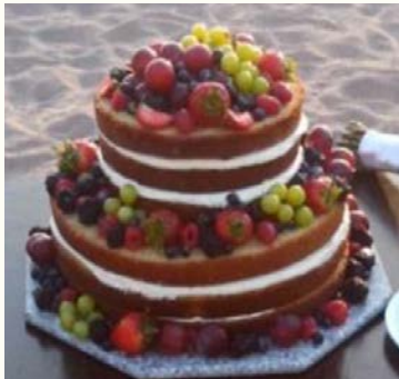
Fruit decoration cake $40 USD