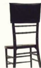
Medium Shantung Chair Cover (3) $4 USD each