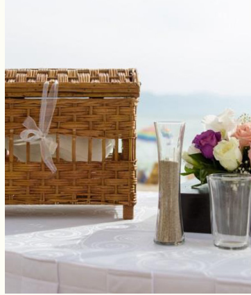
2 dove release $290 USD