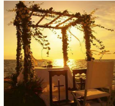
Canopy 6 $950 USD