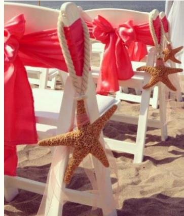
Starfish for chair From $10 USD each