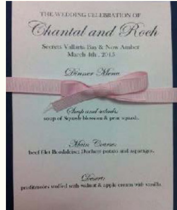
Printed menus From $4 USD each