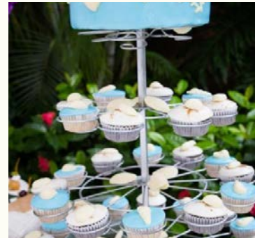
Subject to quote