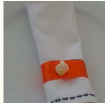
Ring for napkin From $4 USD each