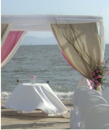
Canopy 1 $650 USD