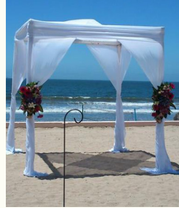
Canopy 3 $500 USD