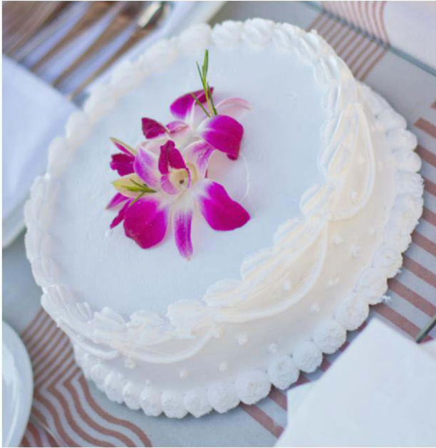
Standard Cake for Secrets in Wedding In Paradise Package