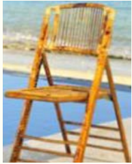
Bamboo Chair $10 USD each