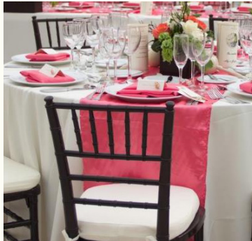
Table runner from $35 USD (Different colors available)