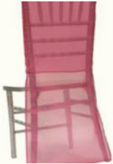
Complete Organza Chair Cover (1) $5 USD each