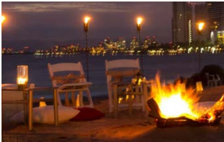
Subject to quote