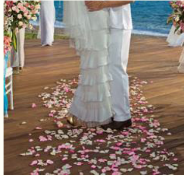
Rose petal for aisle From $55 USD