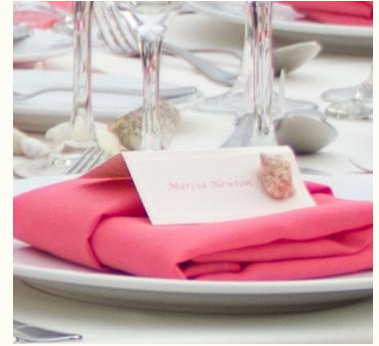
Colored napkin $4.50 USD each (Different colors available)