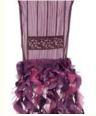
Complete Mermaid Tail Chair Cover $9 USD each