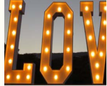
Lighting LOVE $500 USD Make Your Name $200 USD per letter