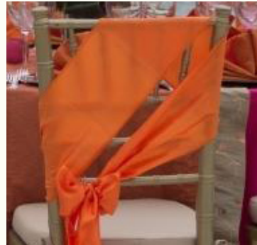
Bow for chair $4.50 USD each (Different colors available)