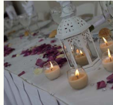
Lantern with rose petals and votive candles $65 USD each