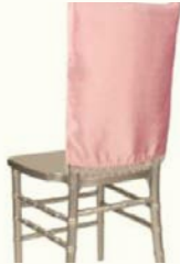
Medium Shantung Chair Cover (2) $4 USD each