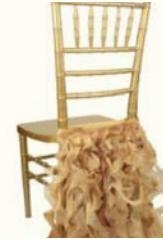
Mermaid Tail Semi-Cover $7 USD each