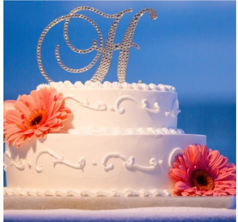
Standard Cake for Secrets of Love and Secrets Ultimate Wedding

*Flowers for the cake are not included but can be added for an additional cost. Please ask your wedding coordinator for customized cakes and flavors.