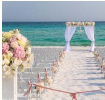
Wedding ceremony set up $1,500 USD