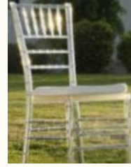
Ghost Chivari Chair $9 USD each