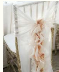
Complete Chair Cover Pony Tail $9 USD each

Chair covers must be ordered 3 months in advance, otherwise, they may not be available.