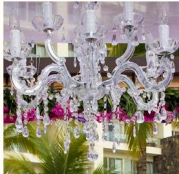
Chandelier From $250 USD